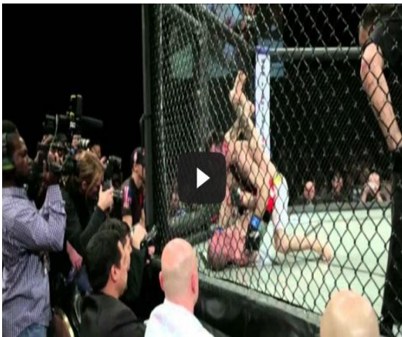
Fighters Source® Amateur MMA League - 2014 Season